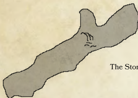
The Stone Rod